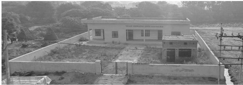
Photograph of Building