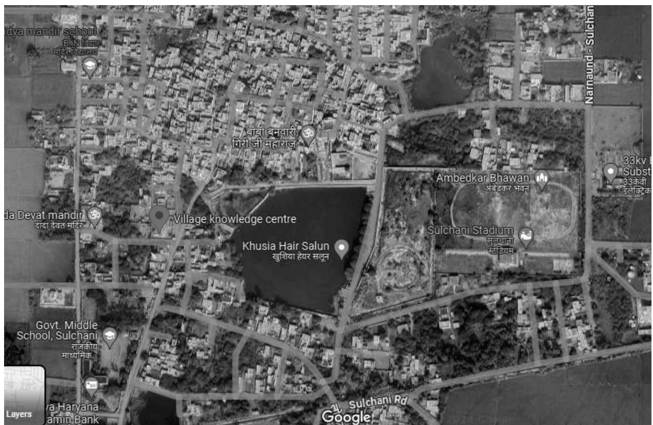
Google Map location showing Site at Rakhigarhi, Haryana “Village Knowledge Centre” Geo-Coordinates: 29.21121494437659, 76.17898019817032